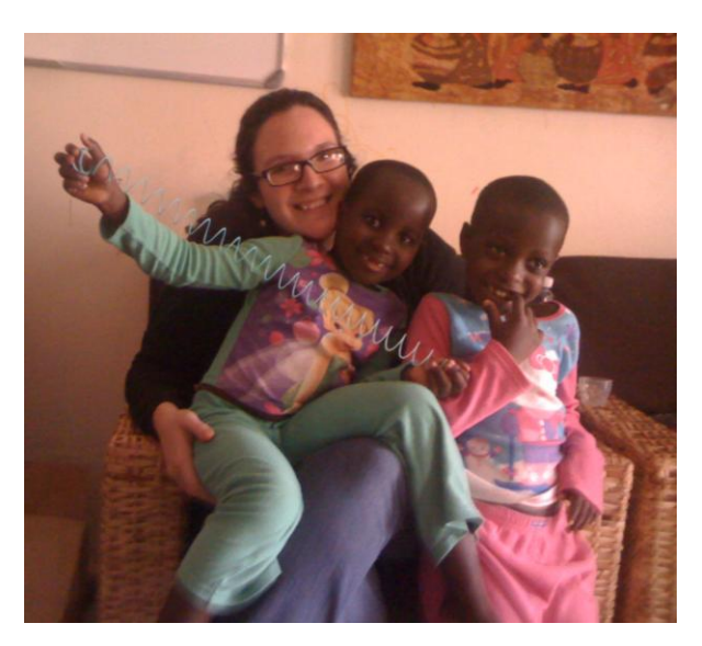
I LOVE holidays because that means more time with the kids and LOTS and LOTS of playtime!