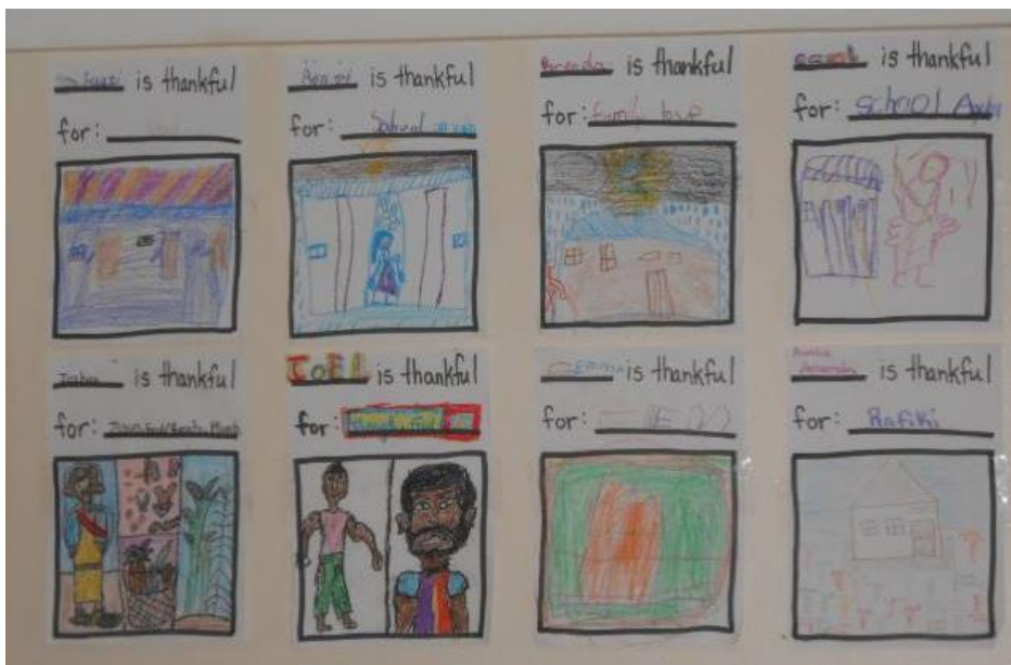
▲ Rafiki kids celebrated Thanksgiving in Uganda! Pictures show what the kids are thankful for!

The Bible says, "Give thanks to the Lord, for He is good; His love endures forever" (1st Chronicles 16:34). I want to challenge you this week to thank God for His incredible gift of grace and forgiveness. Thank Him during the bad times and the good times. "Pray continually; give thanks in all circumstances, for this is God's will for you in Christ Jesus" (1 Thessalonians 5:17-18).